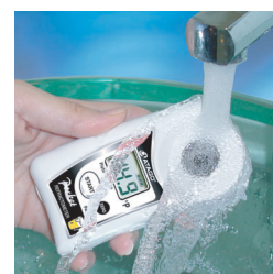
Quick & Easy Cleanup!